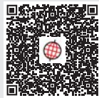
SCAN THE QR TO SEE HOW IT WORKS

There's less of a need to recharge it in your home or workshop. That's Intelli-Start!